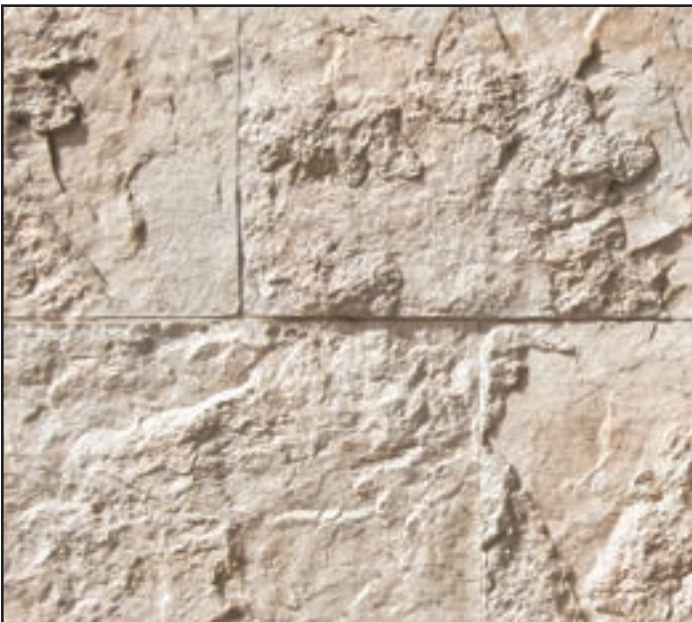
THE GETTY STONE

¼" Full Smooth Tooled Grout Joint (nominal)